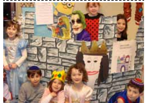
Kindergarten & 1 st grade students prepare for Purim