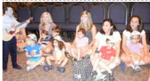
Friday morning Shabbat singing with the Hazzan