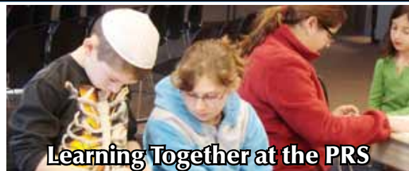
Learning Together at the PRS