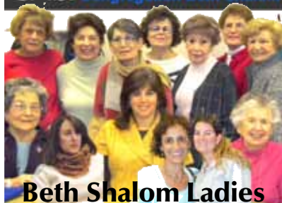
Beth Shalom Ladies

CAbi Ladies' Night Out with Congregation Beth Shalom