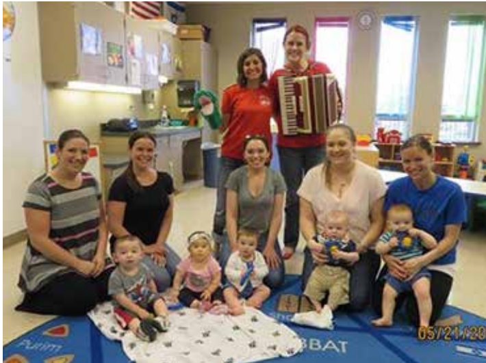
Meet our Future - Beth Shalom Baby Class

Friends, family and the Beth Shalom community are invited to worship with the family and attend the Kid-dush luncheon following services.