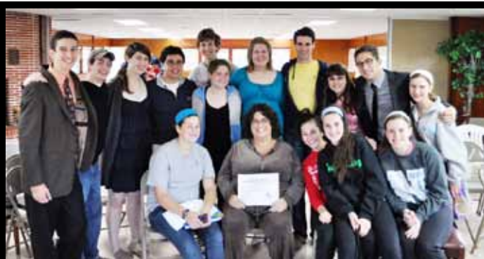
KCUSY members at Spring Kallah, held the weekend of April 15 in Excelsior Springs, MO

CBS Youth are Learning & Growing! And having fun, too!