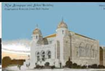
34 th & Paseo