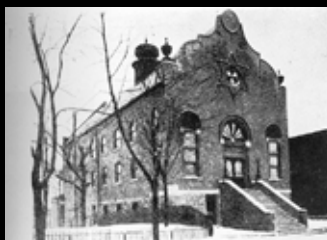
15 th & Locust

Monday & Wednesday 8 am-5 pm Tuesday, Thursday Closed Saturday Closed Friday & Sunday 8 am-4 pm National Holidays 9 am-4 pm Exceptions: Thanksgiving, New Year's Day & Christmas Day Jewish Holidays Closed